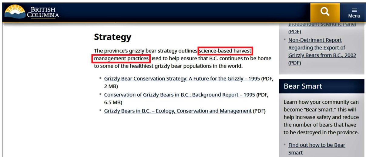
Figure 2: Middle section of government website, captured October 16, 2019, displaying “science-based harvest management” and conservation plans from 1995. (For full text version of this webpage, see Appendix A).

The limitations of strictly science-based management, at the foundational level, are also evidenced in the dispute over grizzly bear population numbers. Grizzly bear population estimates have been disputed by researchers and biologists, and these arguments have been reported by the media. For example, one such article published by CBC reports, “Biologist Paul Paquet from the Raincoast Conservation Foundation says it's extremely difficult to do a