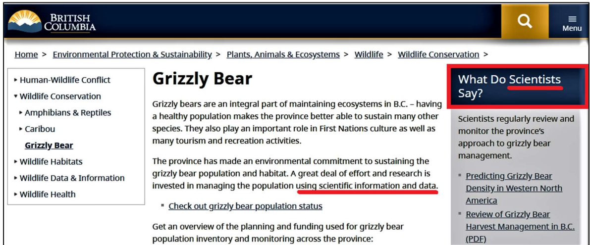
Figure 1: Top section of government website, captured October 16, 2019, displaying links to science-based documents on the right-hand side of the page. (For full text version of this webpage, see Appendix A).